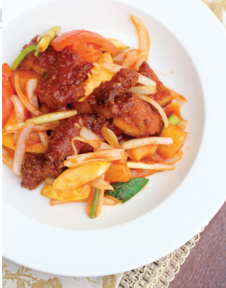
Sweet and Sour

Garlic Baby bok choy, napa, mushroom, zucchini, carrot and squash with toasted garlic-pepper sauce.