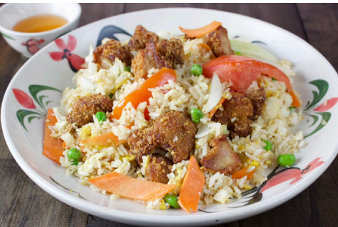
Crispy Chicken Fried Rice