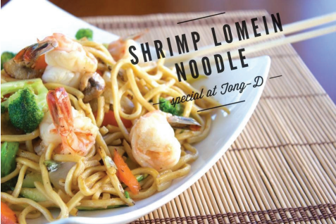
SHRIMP LOMEIN NOODLE special at Tong-D